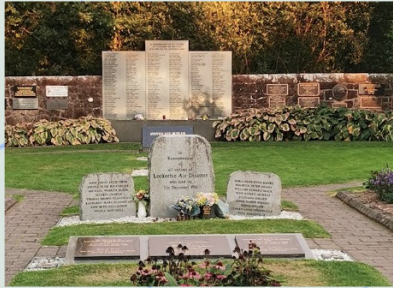
Garden of Remembrance