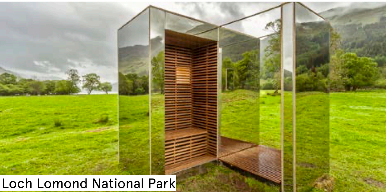
Loch Lomond National Park