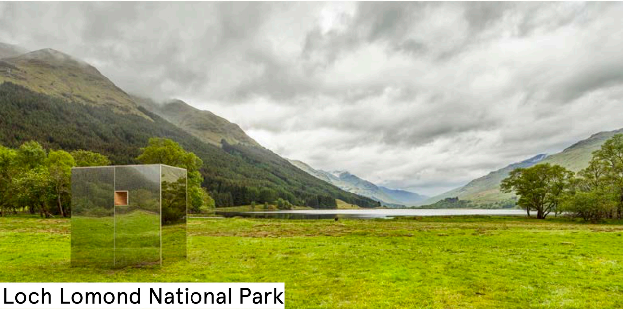
Loch Lomond National Park