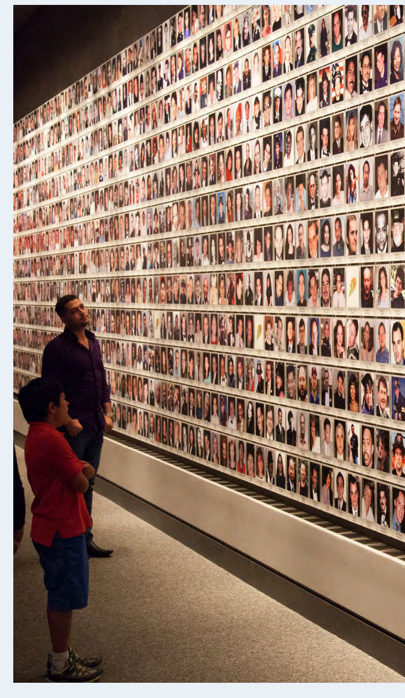
9/11 Memorial & Museum- Victim memorial gallery exhibition

For submissions or to schedule a help session, please email us: info@ pa103ll.org or call (305) 665-6470